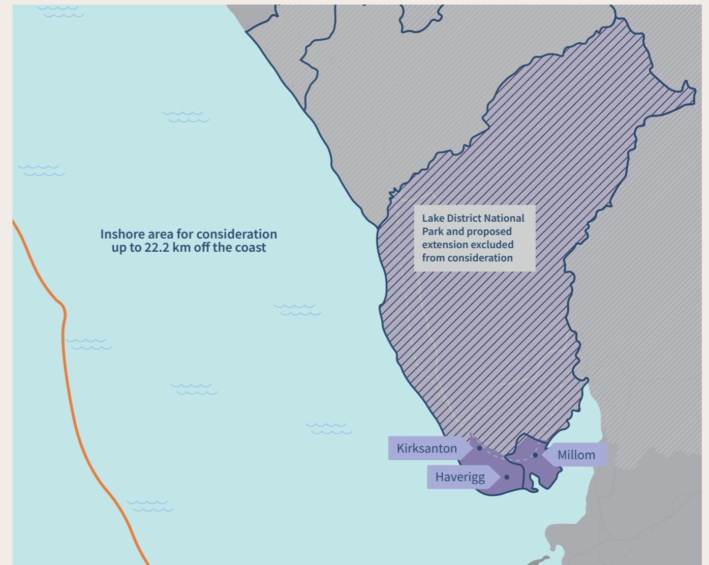
Illustrative map of one of two search areas identified by the Copeland GDF Working Group